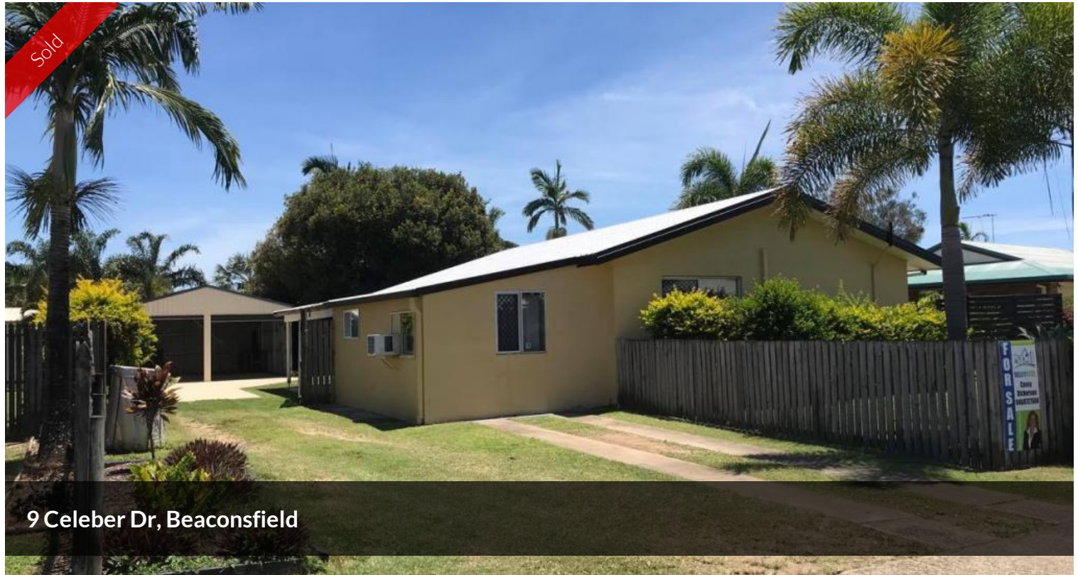
9 Celeber Dr, Beaconsfield