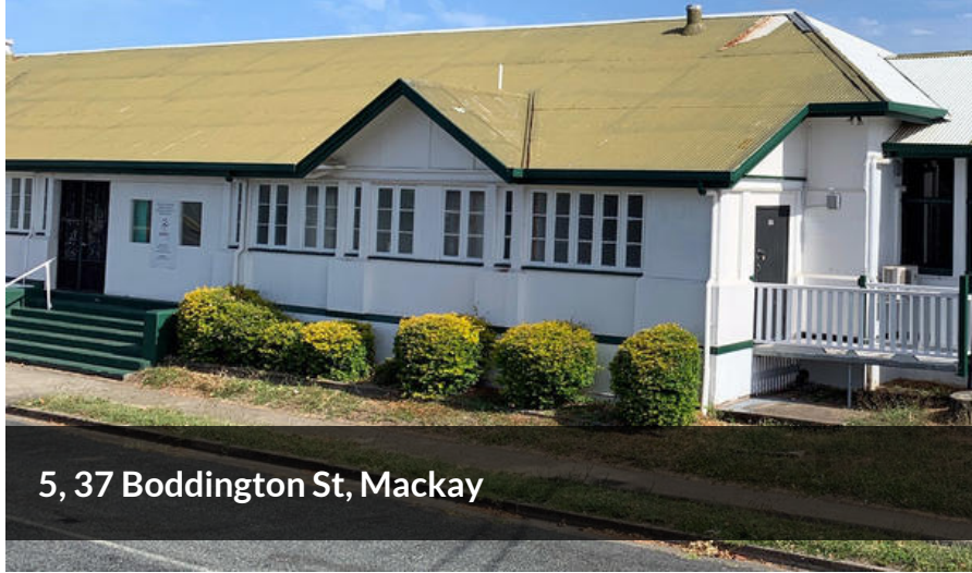
5, 37 Boddington St, Mackay