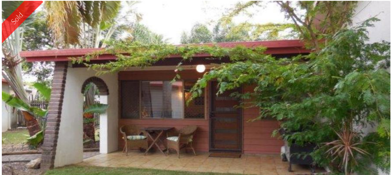
Unit 3, 3 Rolston St, South Mackay